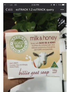
比利山羊奶蜂蜜手工皂100g 09339932000293 (W5N20170500001-4H-1)