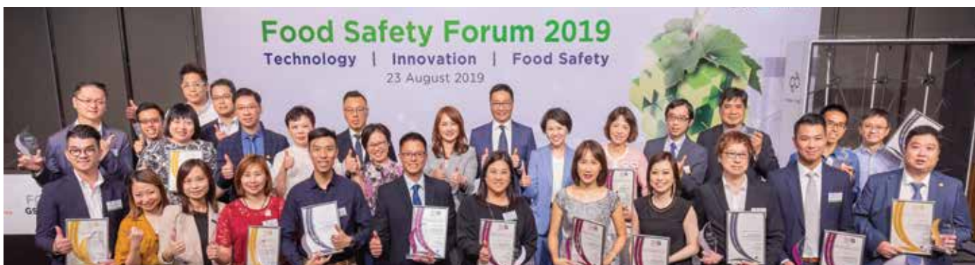
「優質食品源頭追蹤計劃2019」頒獎典禮 「Quality Food Traceability Scheme 2019」 Award Ceremony

Audit will be performed by GS1 Hong Kong.