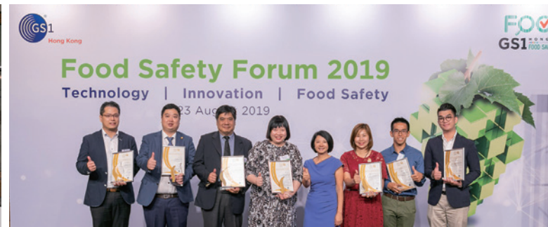
Gold Enterprise Winners 金企業獎得主