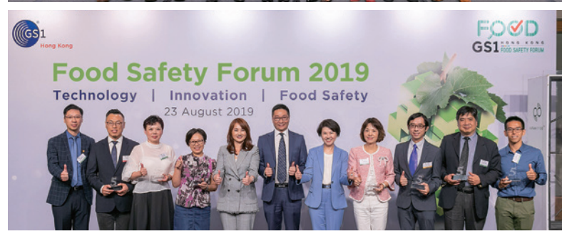
5 Consecutive Years' Award 五年連續當