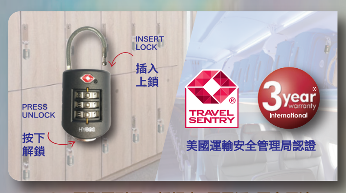
3X 更堅固耐用不銹鋼索 更靈活 更多用途