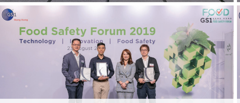
Silver Enterprise Winners 銀企業獎得主