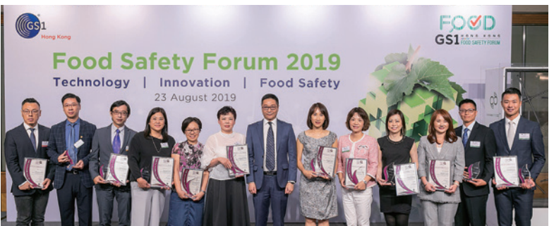
Diamond Enterprise Winners 鑽石企業獎得主